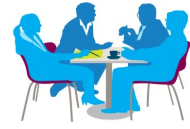
EMC Events and Training