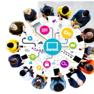
EMC HR Bulletin