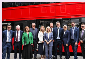
EMCCA Mayor meets with Prime Minister