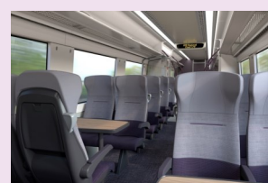
EMR release first images of refurbishment plans