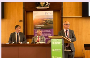
East Midlands Councils' AGM