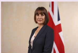
Chancellor outlines plans on public expenditure