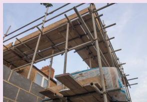
Consultation on reforms to the National Planning Policy Framework