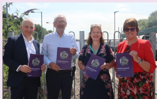
East Midlands Leaders call for investment in regional rail