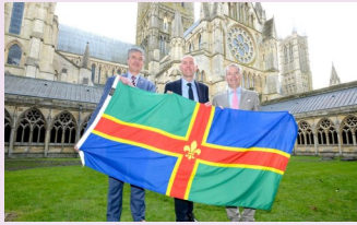
Greater Lincolnshire CCA Holds First Meeting