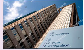
Council Support for Afghan Resettlement