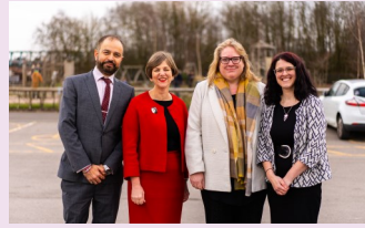
East Midlands to get multi- million EV charge funding