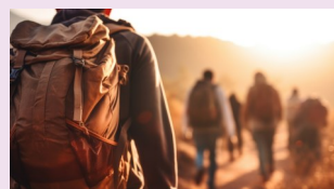
Asylum Dispersal Grant Funding