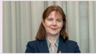
EMCCA secures Government backing for Growth Priorities