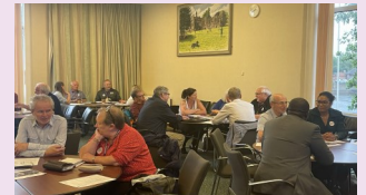
Upcoming EMC Training