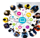
EMC HR Bulletin, April 2019 Edition