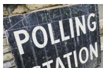
Local Election Results across the East Midlands