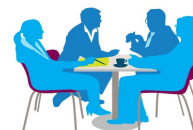
EMC Events for Councillors and Officers