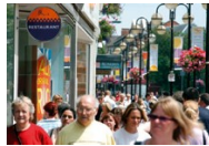
Provisional local government finance settlement