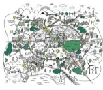
Programme to support Place Making at local level