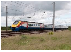
EMC response for DfT's EM Franchise consultation