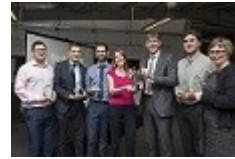
East Midlands LA Challenge 2017