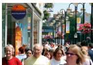
Funding for Homelessness in the region