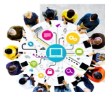
EMC HR Bulletin - March Edition