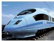
Infrastructure News from the East Midlands