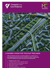
Key Strategic Transport Priorities for the East Midlands