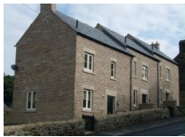
Changes to National Planning Policy Framework