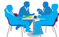
EMC Events for Councillors and Officers