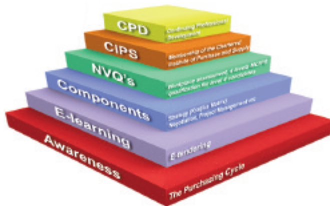
Figure 2 – The Procurement Skills Staircase

The Training page features the Procurement Skills Staircase (Figure 2) which represents the different steps of training available to help people procure goods and services more effectively. Users can click on each step - according to their skill level and what they want to achieve – to find out more information, the staircase offers advice concerning basic awareness of the procurement cycle through to achieving CIPS qualifications and how to continually develop professionally.